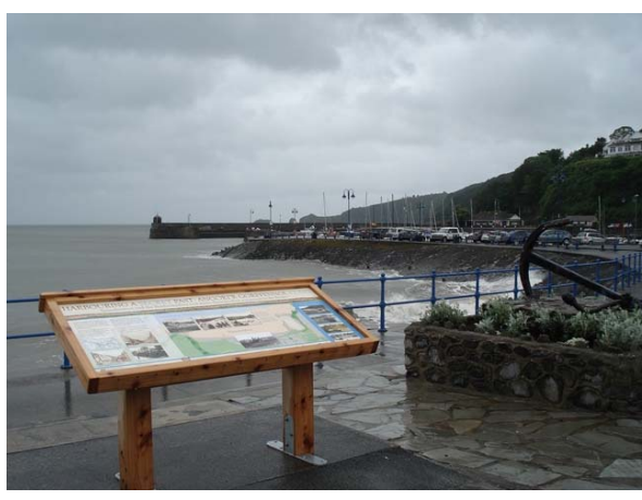
Saundersfoot Harbour panel

In the December issue of the Heritage Herald you heard about the interpretation of the industrial heritage story in the Kilgetty and Saundersfoot area that had started in 2011. All the work has now been completed and if you are out and about in Saundersfoot don't forget to look out for the new interpretation panel with stunning photographs of the old harbour or learn more about the unique landscape in the Plantation woodland. At