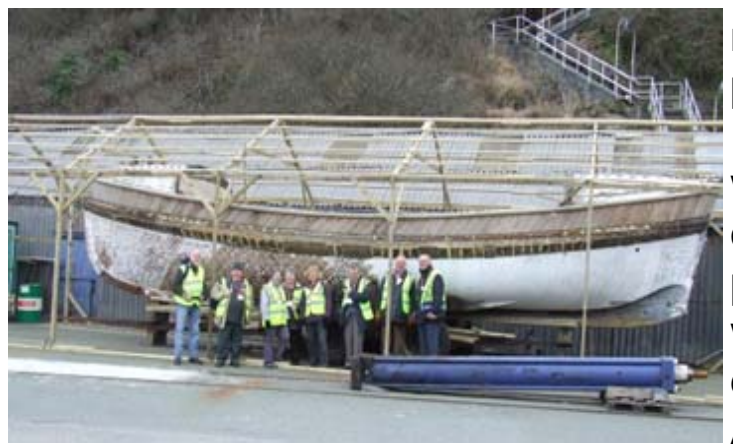
The group in front of the Charter House lifeboat built in 1910, recently restored by local people

Officially opened in 1906, the port of Fishguard was once a bustling place. It was visited by Mauretania, the first Cunard liner to use the port,