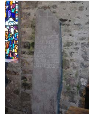
The Caldey Island Ogham stone

Welcome to the summer edition of our biannual heritage newsletter. This newsletter will keep you up to date on the projects PLANED supports across the county. We are continuing our work celebrating and appreciating local heritage under two of our projects, 'Sustainable Communities' and 'Adding Value to Community Tourism'. These projects are funded through the Rural Development Plan for Wales 2007-2013 which is funded by the Welsh Government and the European Agricultural Fund for Rural Development.